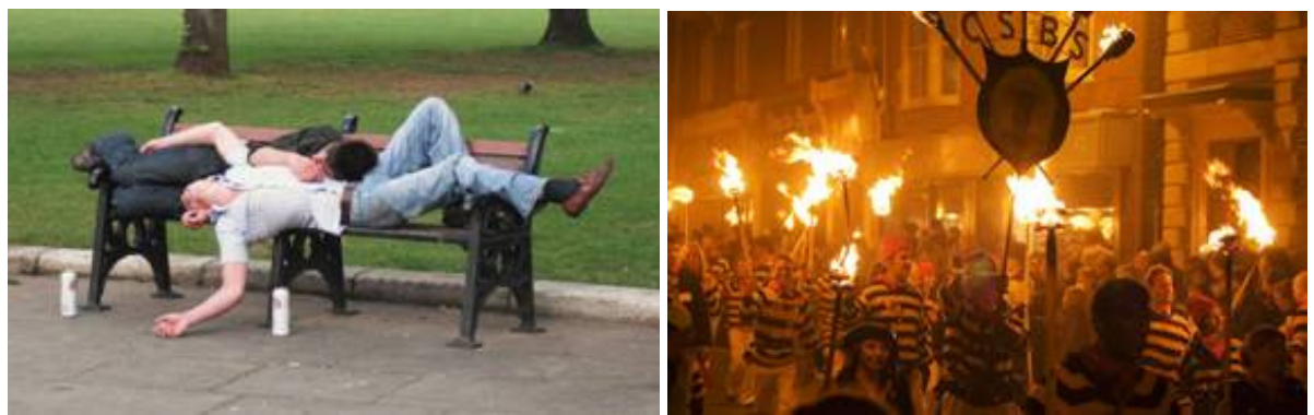
Sunday, 19 September 2010 at the Nightcliff Sports Club. Yep...it's gonna be big!

That numbing sensation a Nightcliff cricketer may experience the day immediately after celebrations and/or commiserations undertaken on Sunday , 19 September 2010 , (starting) at the Nightcliff Sports Club which are expected to go long into the night!